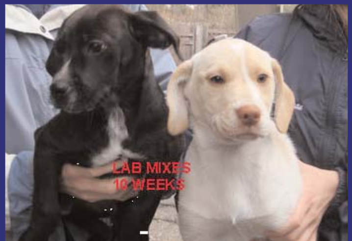
LAB MIXES 10 WEEKS