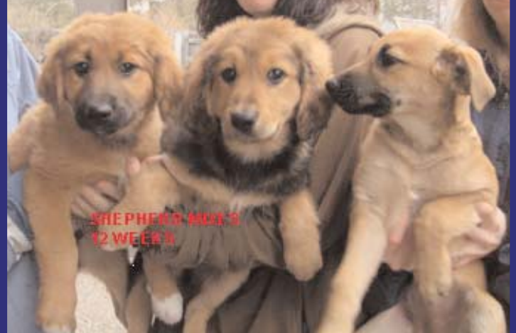
SHEPHERD MIXES 12 WEEKS