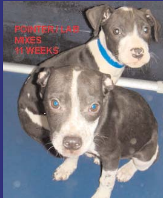
POINTER / LAB MIXES 11 WEEKS