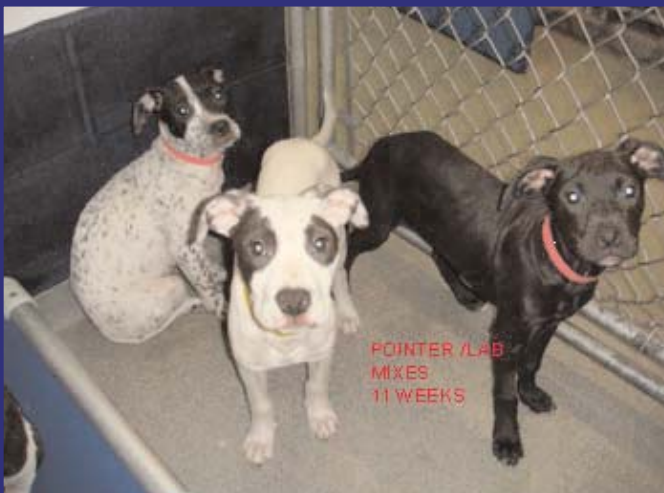
POINTER / LAB MIXES 11 WEEKS