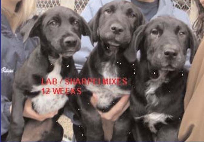
LAB / SHARPEI MIXES 12 WEEKS